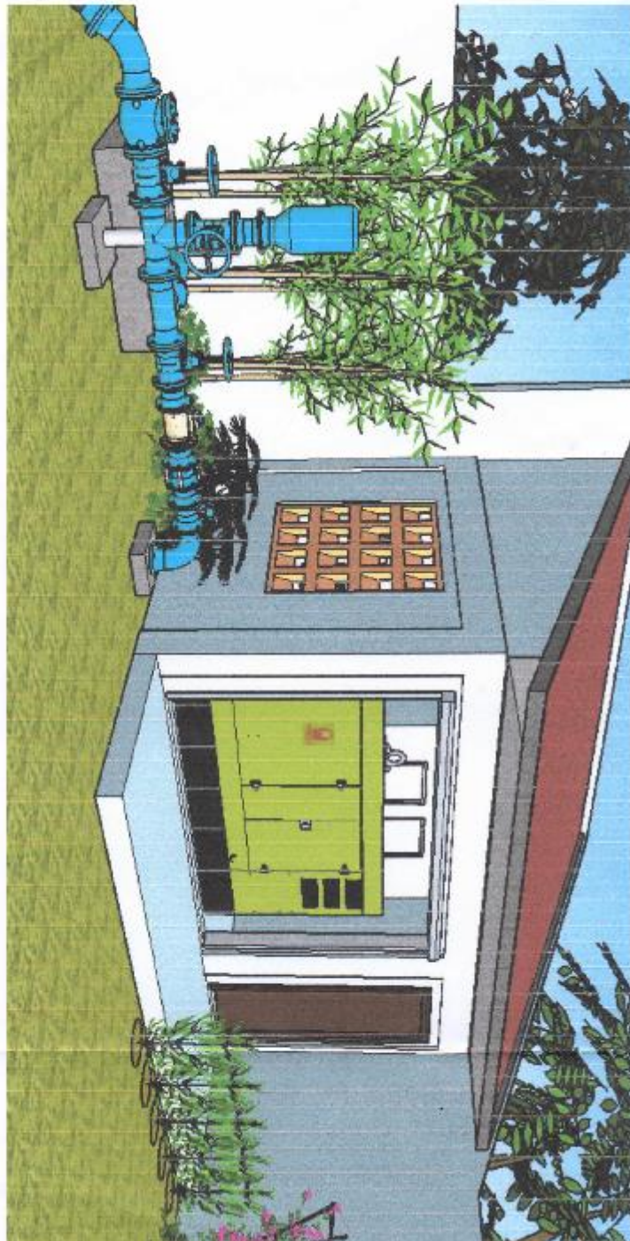
PROPOSED PUMPING STATION, POBLACION ZONE 1, VILLASIS PANGASINAN Floor Area: 15 SQ.M LOT AREA: 400 SQ.M

Insert here a list of Drawings. The actual Drawings, including site plans, should be attached to this section or annexed in a separate folder.